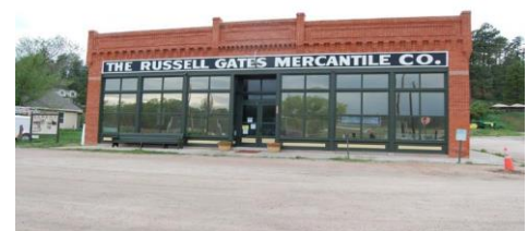
Elbert's Community Center Today

The Elbert Town Committee is a Colorado non-profit organization in accordance with CRS#7-122-101 and classified as a section 501 (c) (3) organization and donors may deduct contributions to us under section 170 of the code.