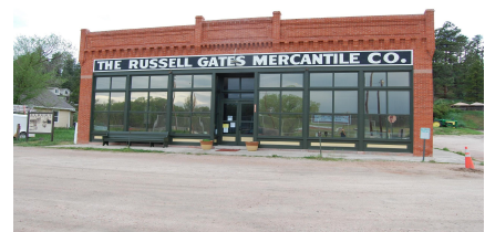
Elbert's Community Center Today