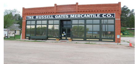
Elbert's Community Center Today