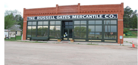
Elbert's Community Center Today