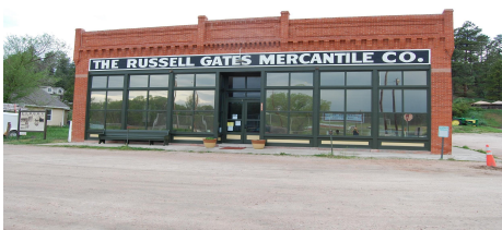
Elbert’s Community Center Today